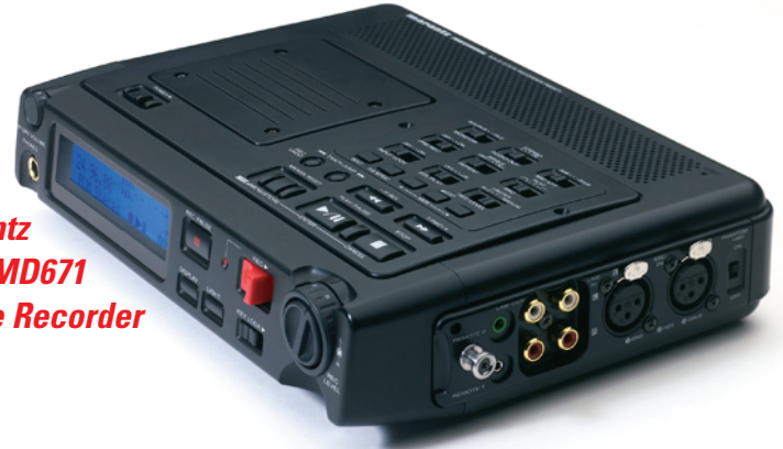
The Marantz PMD671 Portable Recorder

FTR Hearings is compatible with various approved portable digital recording devices.